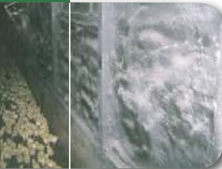
< AgriThane® can provide blackout conditions for poultry.