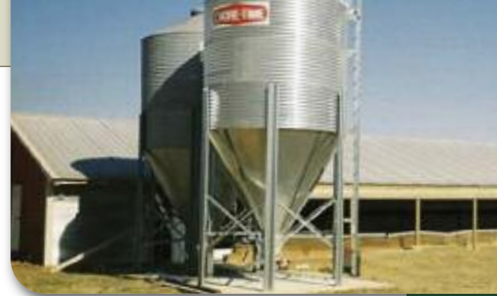
^ Virtually any structure can be insulated with AgriThane®.

(Please consult NCFI Polyurethanes for proper cooler and freezer applications and design.)