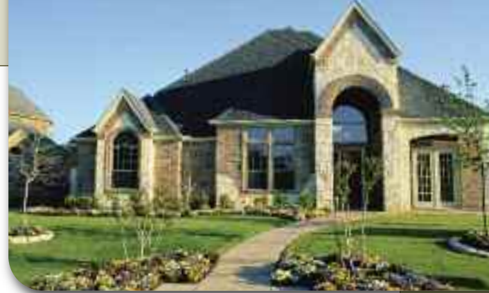
▲ InsulStar® insulates in every weather condition.

InsulStar® is the most energy-efficient, environmentally friendly, closed-cell spray-in-place polyurethane insulation system available. It is formulated from renewable agricultural resources and it saves homeowners significantly on energy costs compared to other common types of insulation. It stops air leakage into and out of your home, reduces noise, and blocks dust, pollen and other airborne pollutants for a more comfortable environment.