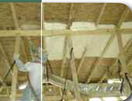
< Allows for unvented attic application.