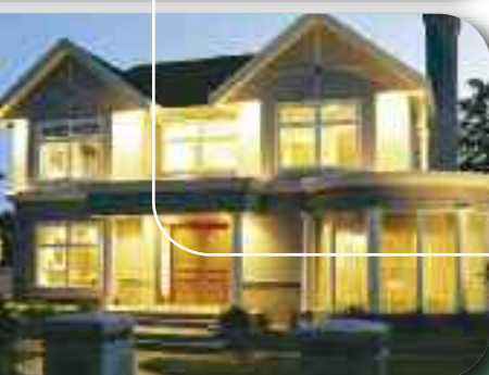
< Reduces energy consumption and saves on monthly power bills.

By designing and building a highly energy-efficient, low maintenance home, the reduction in energy demands for heating and cooling will lower demand on utility companies for the life of house. With Sealite you can insulate directly to the roof deck, bringing all of the space under the roof into use. By putting HVAC ductwork in conditioned space, energy waste from leakage is eliminated. The additional conditioned space can then be utilized for computer rooms, bonus rooms, playrooms, or closet space. Previously wasted attic areas become valuable living space for very little cost, while adding tremendous retail market value to the house. Add up the benefits and it's easy to see that Sealite is the high performance insulation solution you've been looking for.