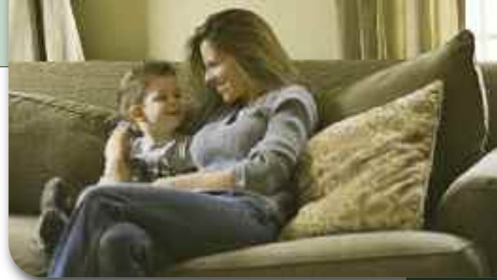
△ Improves indoor air quality by keeping out dust and pollutants.

Sealite open-cell spray-in-place polyurethane insulation saves the homeowner on energy costs compared to other common types of insulation. Sealite provides the desired R-Value plus the added advantages of spray-in-place polyurethane: it stops air flow into and out of your home, reduces noise, and blocks dust, pollen and other airborne pollutants for a more comfortable environment. It is also environmentally friendly, containing renewable agricultural resources, and is odorless.