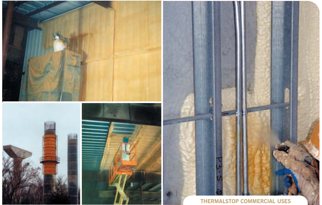
THERMALSTOP COMMERCIAL USES