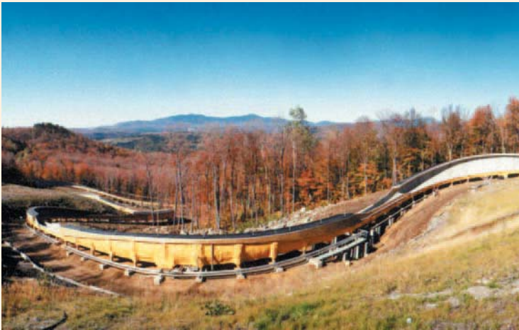
THERMALSTOP INSULATES THE LAKE PLACID BOBSLED RUN.