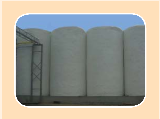
TANK INSULATED BY THERMALSTOP.